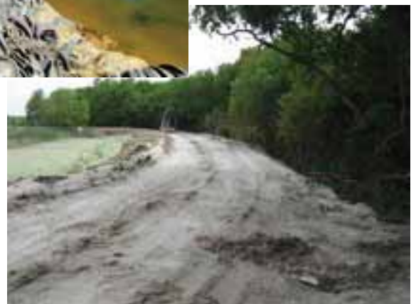
From the end of the campground, a new access and escape road was built for Sugar Point.