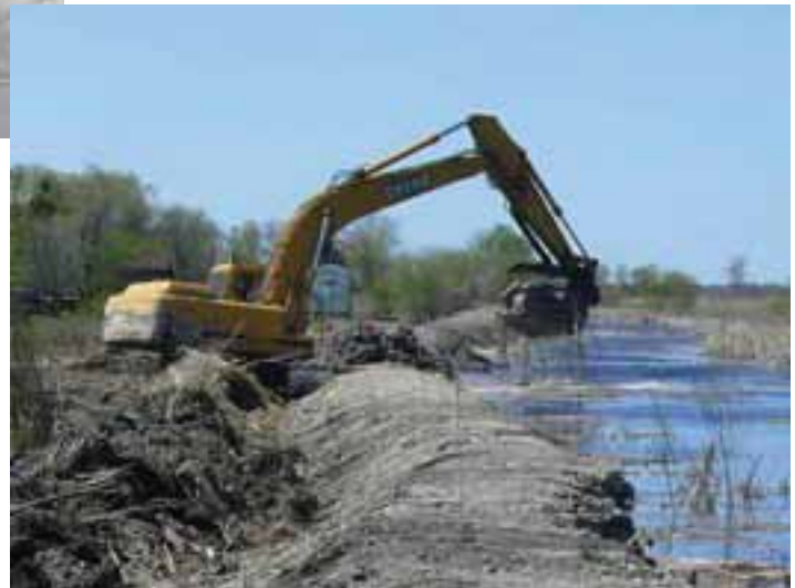
Without the clay dikes, many of our places would already have been flooded.