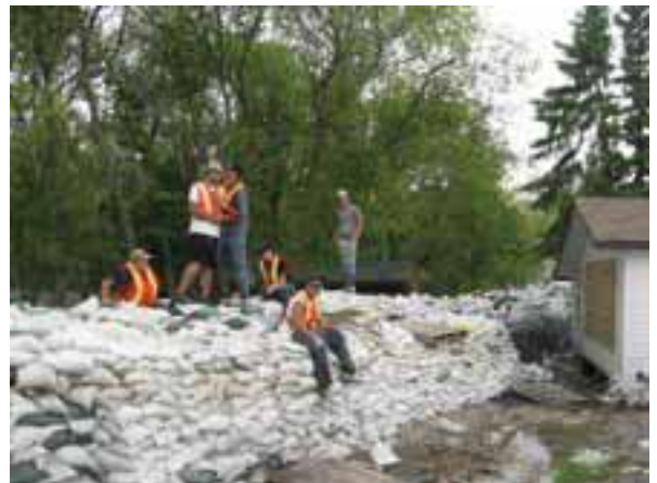
Now dikes and water are on their doorsteps.