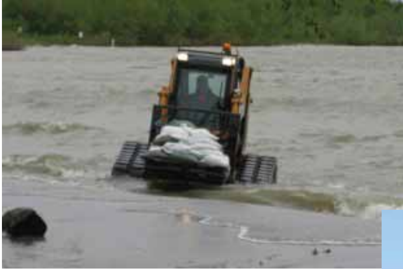
As fast as people can pallet sandbags, Vern, and other skidsteer operators, deliver them to dike sites.