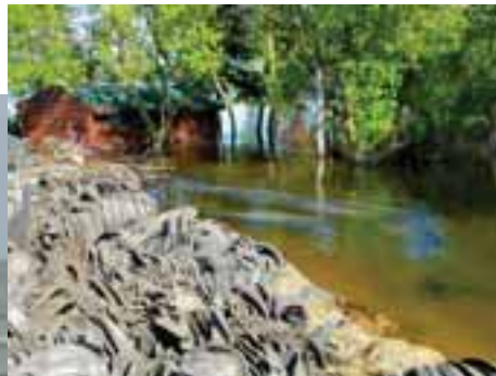
Draping blast mats over narrow clay dikes helps to prevent erosion.