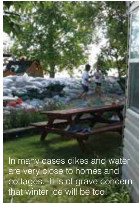
In many cases dikes and water are very close to homes and cottages. It is of grave concern that winter ice will be too!