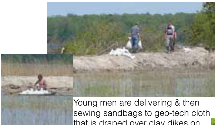
Young men are delivering & then sewing sandbags to geo-tech cloth that is draped over clay dikes on the north side.