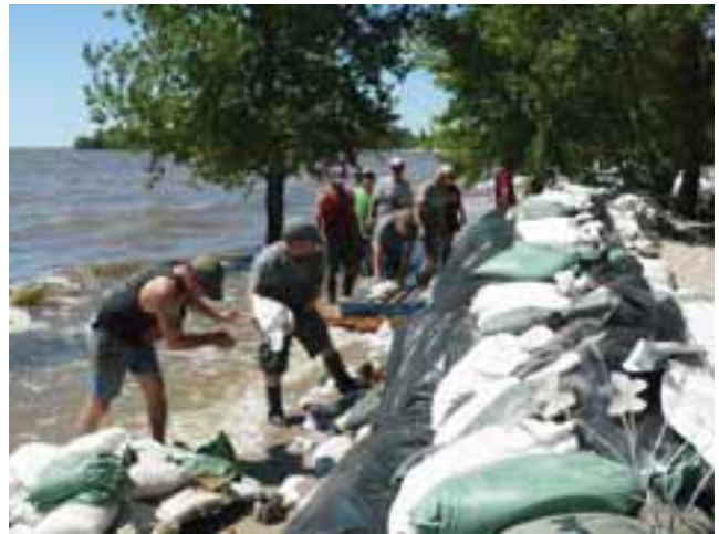
Lakeshore dikes are built to a height of 821 ft. above sea level, and have a top layer of poly.