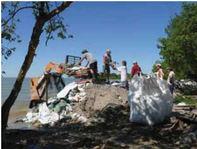
Raising a dike, and securing the poly. At night, and when winds are high, skidsteer access places are blocked by 'super sandbags'. Each weighs 1500 - 2000 lbs.