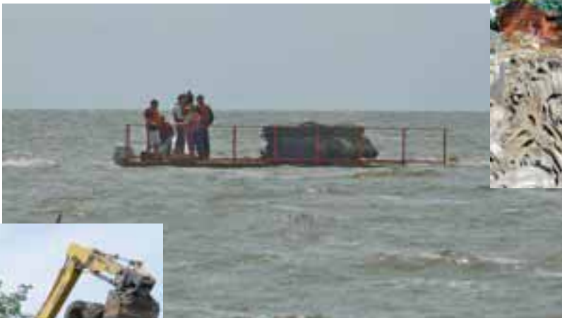
Blast mats, made from recycled tires, are now being draped over the clay dikes to stop erosion. They are transported to their dikes by - truck, backhoe, and barge.