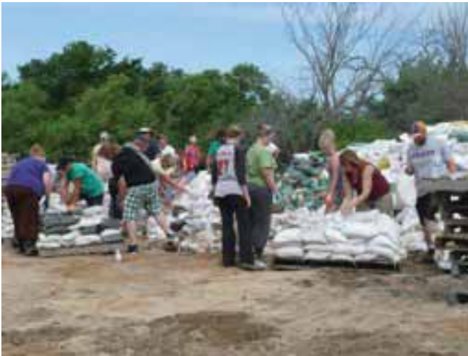
Palleting sandbags is hard and hot work!

With the lake up 5 feet, water is encroaching, and is held back by dikes on all sides. Only the road and homes and cottages along it are dry. In most areas, close to the dikes flood water is 4 - 5 ft deep)