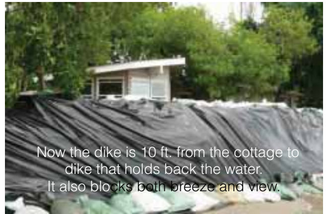
Now the dike is 10 ft. from the cottage to dike that holds back the water. It also blocks both breeze and view.